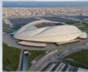
Al Janoub Stadium