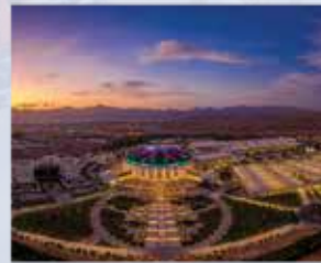
Diar Ras Al Hadd