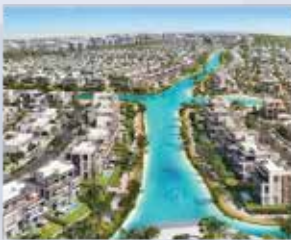
Dubai South Residential City