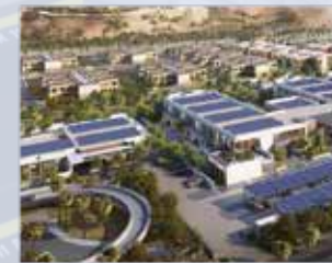
Yiti Sustainable City