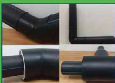
All Types of Fittings Fabrications