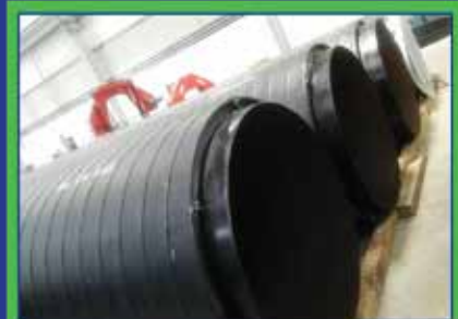
Largest Diameter Jacket Pipes