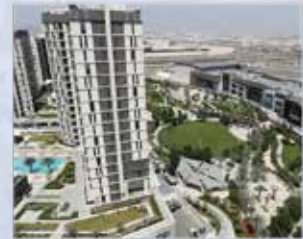
Dubai Expo Village