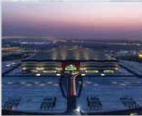
Al Bayt Stadium