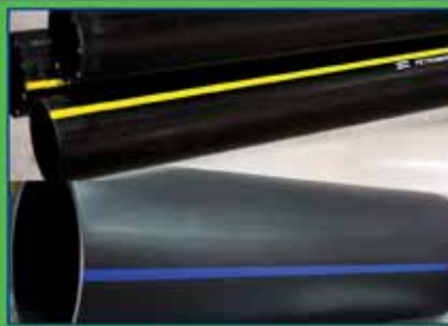
HDPE Pipes for Water & Gas