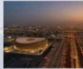
Lusail Iconic Stadium