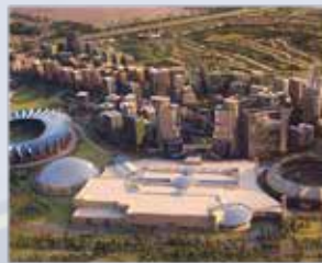
Dubai Sports City