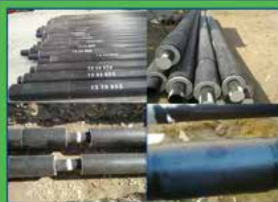
Easy Installing Field Joints