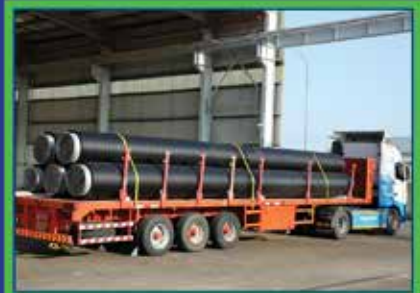
Output 1/2" - 80" 1 KM Per Day