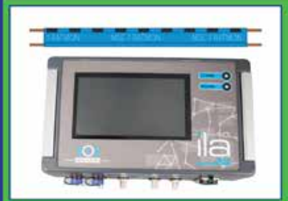
Leak Detection System