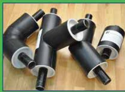
Signature End Cap Design